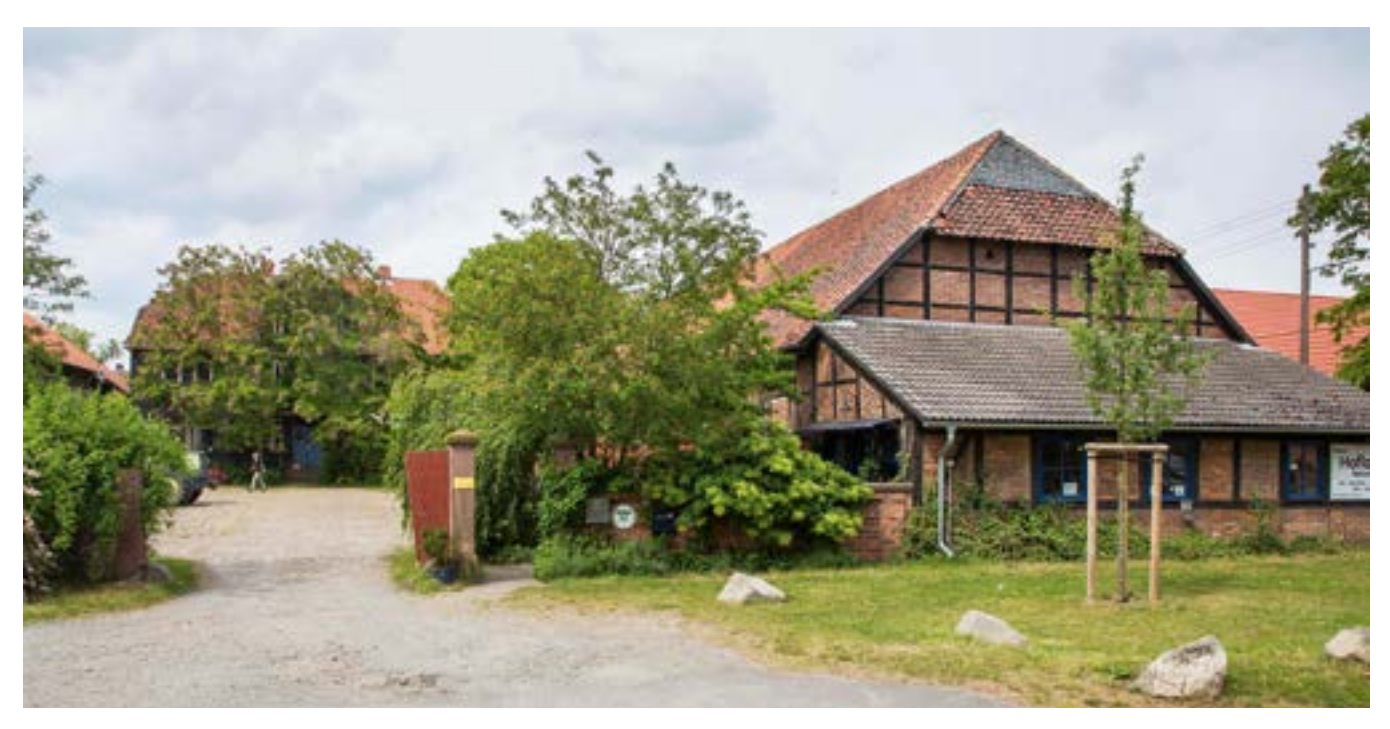
Organic farm in the monastery complex Dibbesdorf.