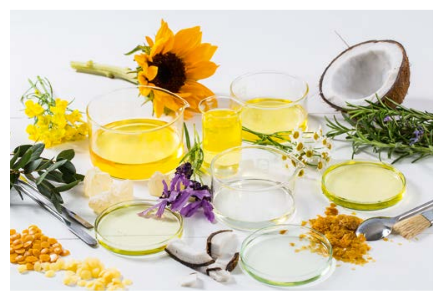
A variety of natural raw materials determine the composition of AURO products.

The aim is to ameliorate existing product compositions in order to advance their effectiveness and achieve ecological advantages at the same time. New raw materials can, for example, be considerably more effective. Consequently, less of the material has to be used in the formulation, for the benefit of the environment.