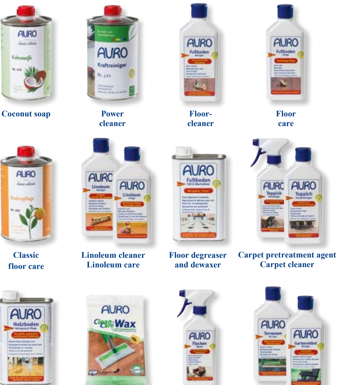
Stain remover spray